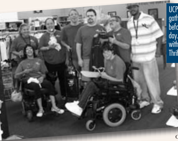
UCP volunteers stop to gather for a quick picture before finishing for the day. Everything is done with a smile here at the Thrift & Boutique.